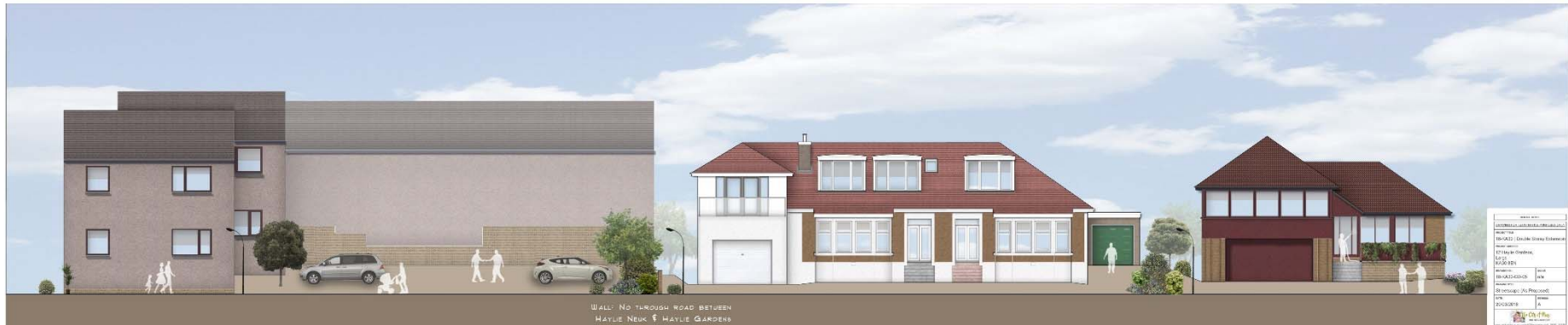
Fig 4. Streetscape Image of Application Property (No.12) as viewed in context of the streetscape on Haylie Gardens (looking east).