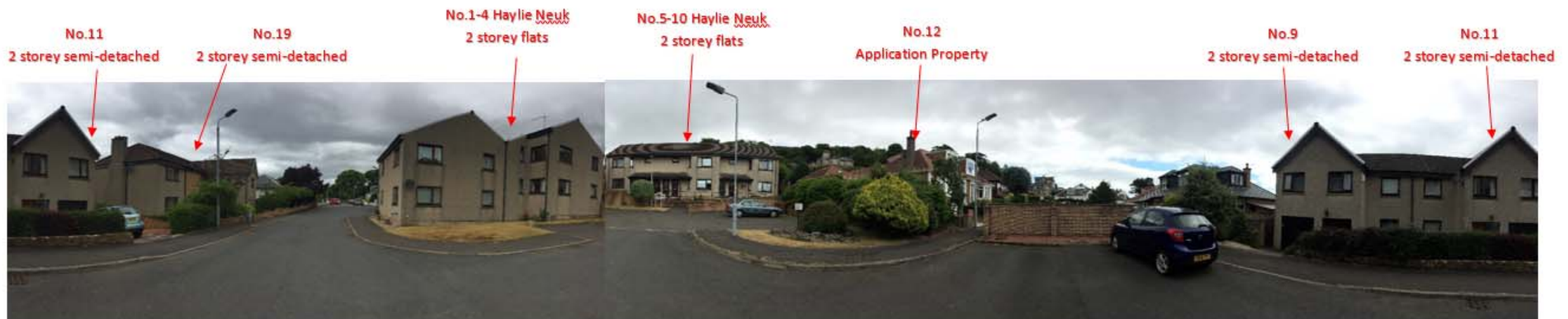
Fig 1. North elevation of application property as viewed from road at no.11 Haylie Gardens. Panoramic photograph shows the property in context with adjacent 2 storey dwellings.