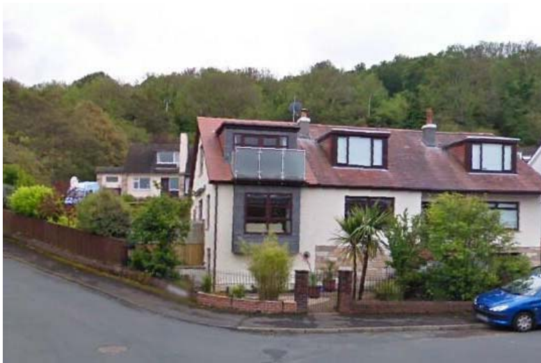
Fig 5. Application Approved side extension at 34 Scott Drive (07/00782/PP)