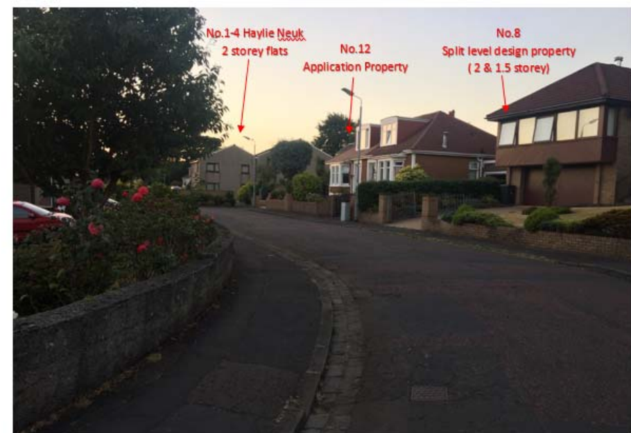
Fig 3. Application Property as viewed from outside no.3 – photo illustrates that side extension would not be seen from the South on Haylie Gardens given that side extension does not breach existing building line. Also shows the application property viewed in context with existing 2 storey adjacent properties/ surrounding properties characterised by different designs.