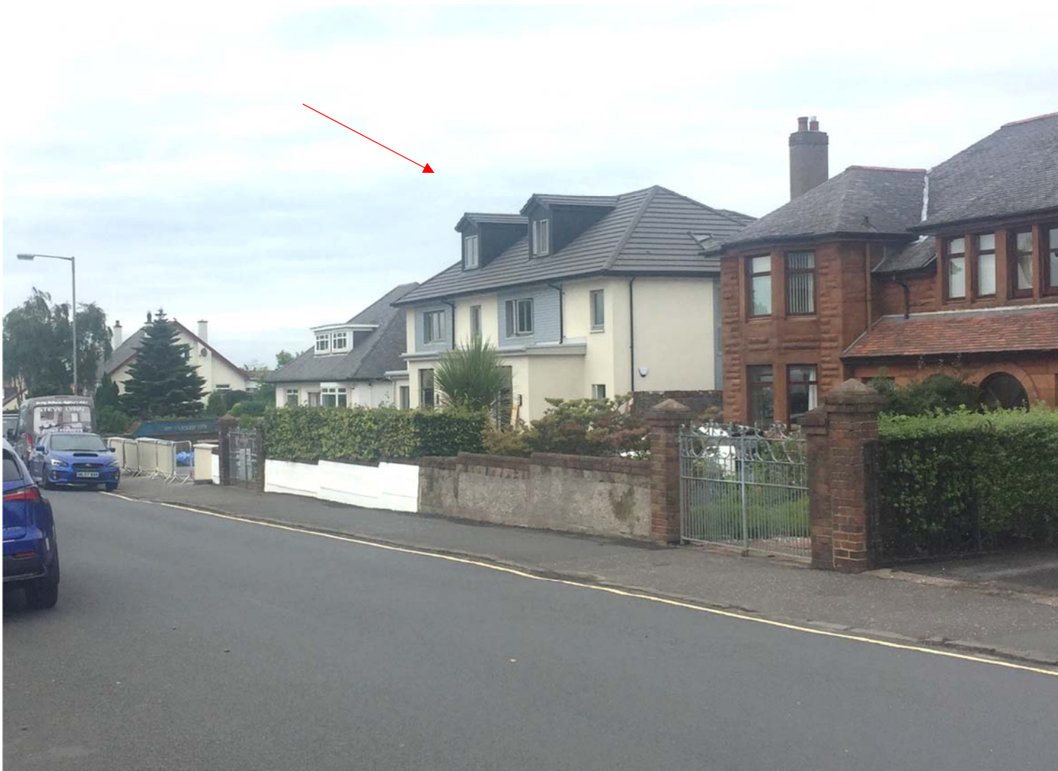
Fig.7 Beachway, Largs – subdivision & substantial extension/ alteration to form 2 semi-detached dwellings (Application: 16/00069/PP)