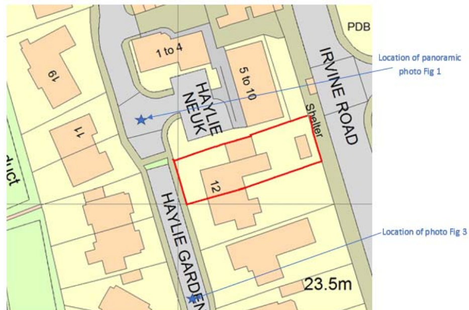
Fig 2. Application Property & position of panoramic photo in Fig 1 & photo in Fig 3.