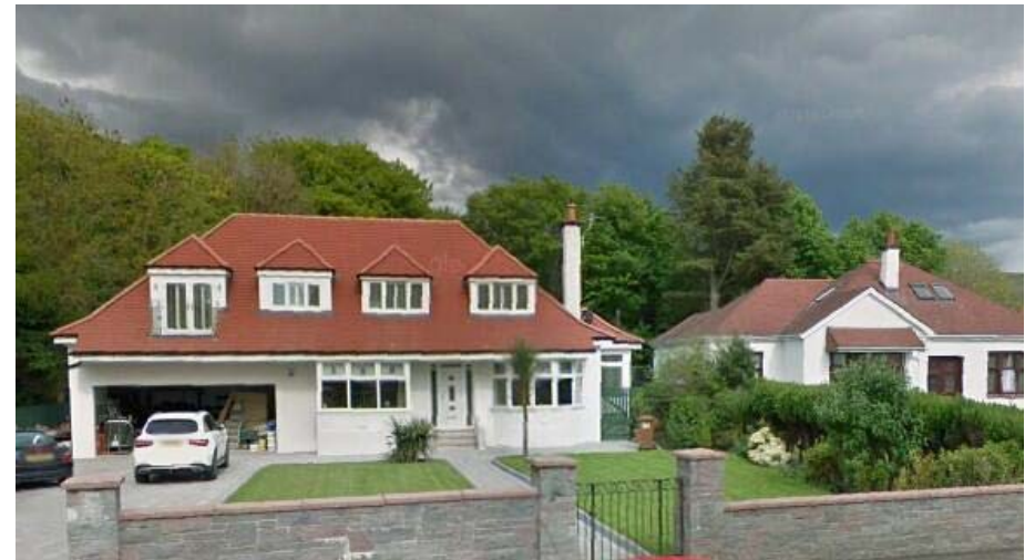
Fig 6. Substantial side extension 84 Greenock Road (Application:15/00127/PP)