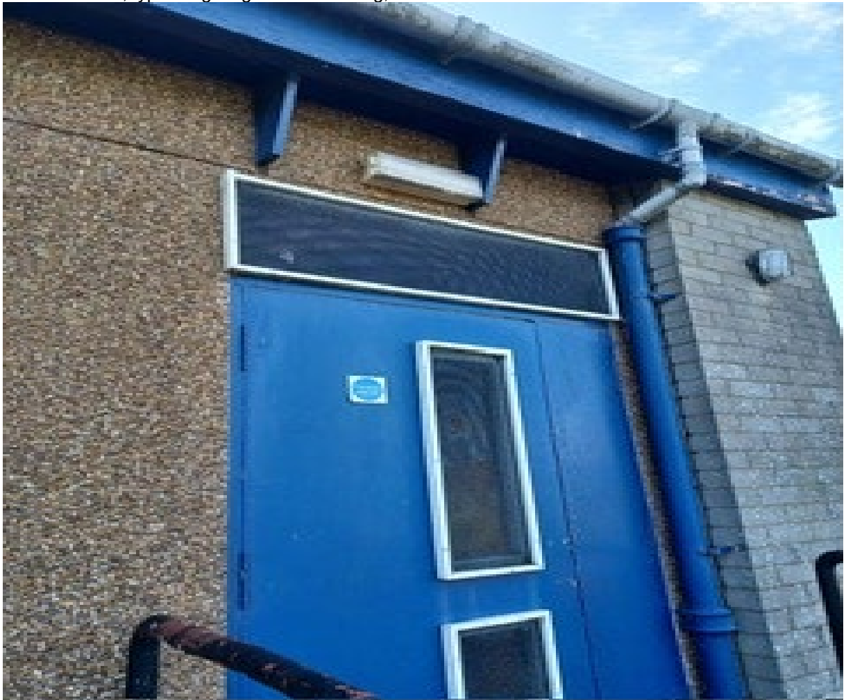
Types of lighting around building, very poor .