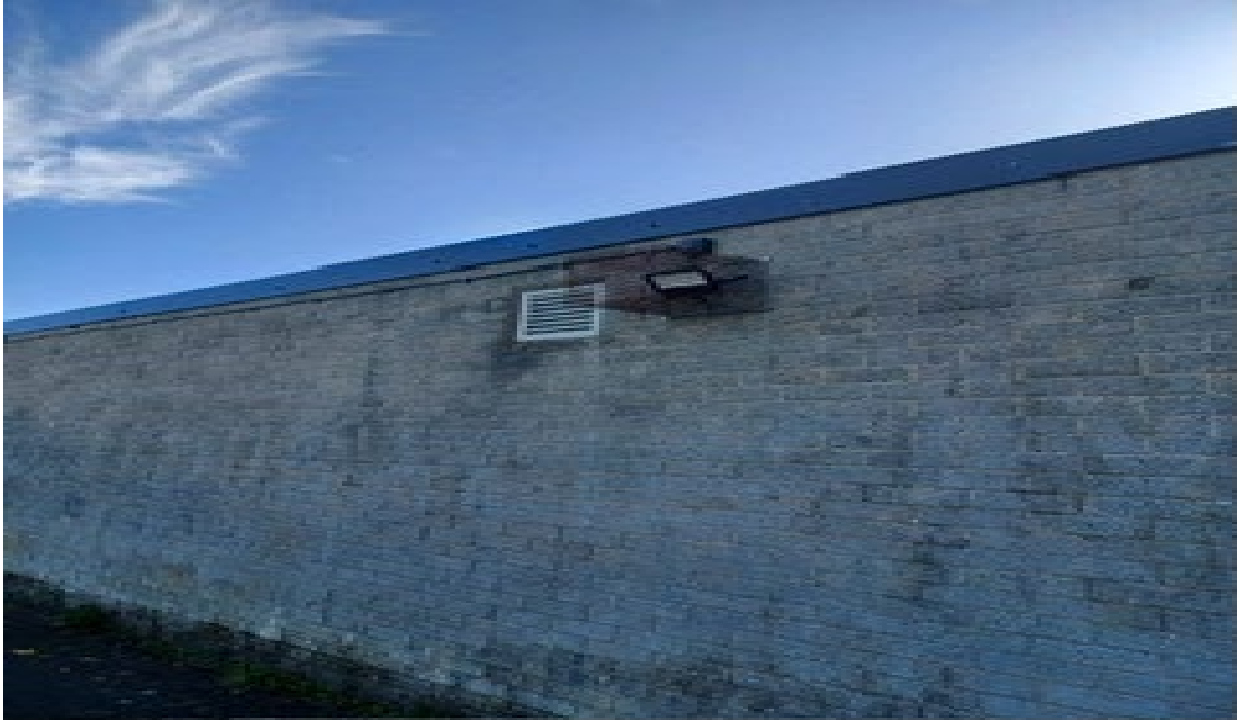
Lighting Columns facing training area and not building