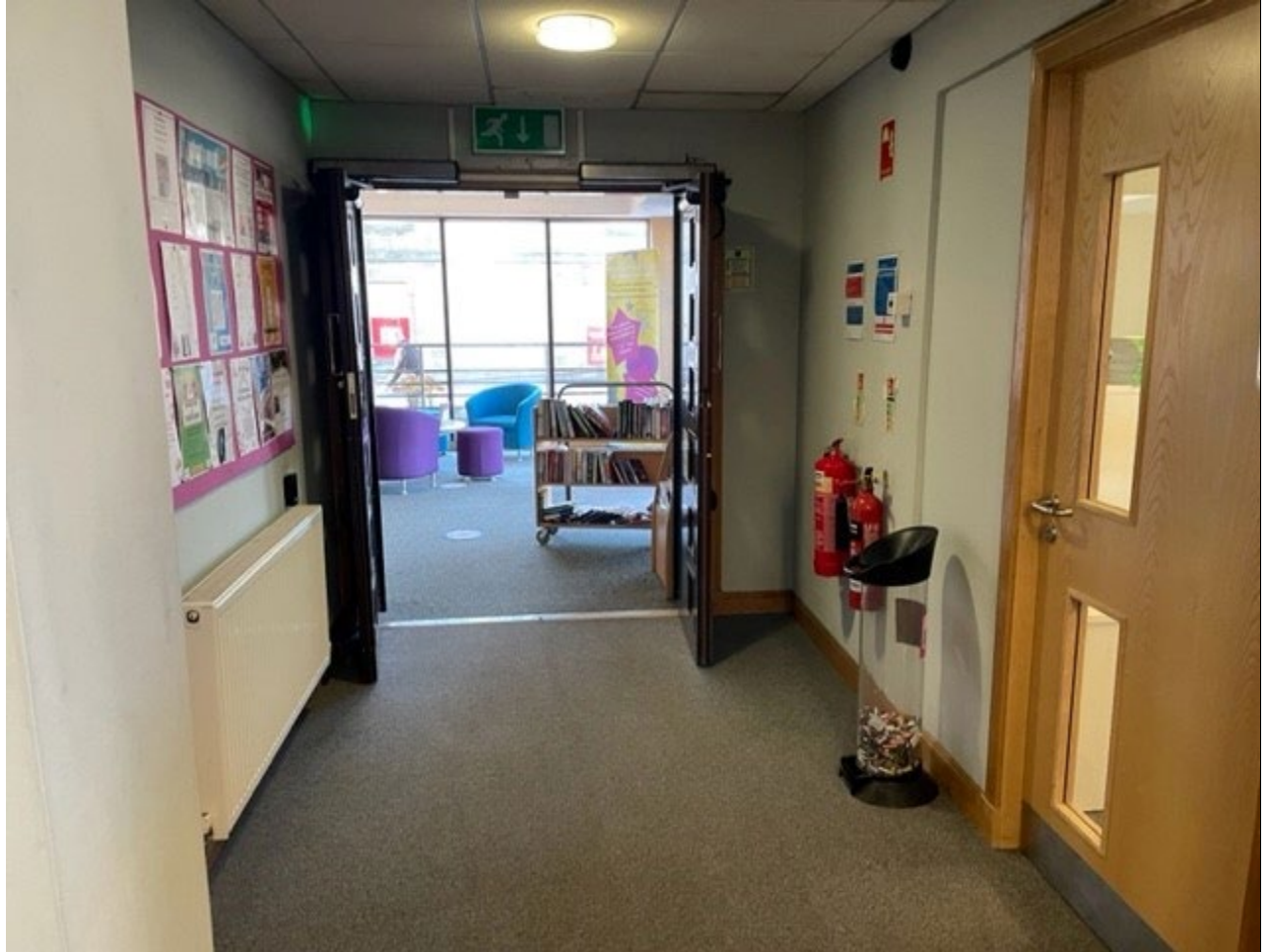
Corridor leading into library, from main entrance.

Show internal areas of the building, excluding the actual polling station where voting will take place, including corridors that link to the polling station, kitchen and toilets, and highlight any possible signage requirements and potential hazards. Also indicate door swing direction and ease of opening, any areas of poor lighting, and any areas of uneven floor, etc.