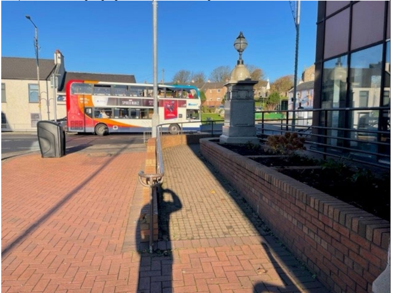
Ramp access around to front of building.