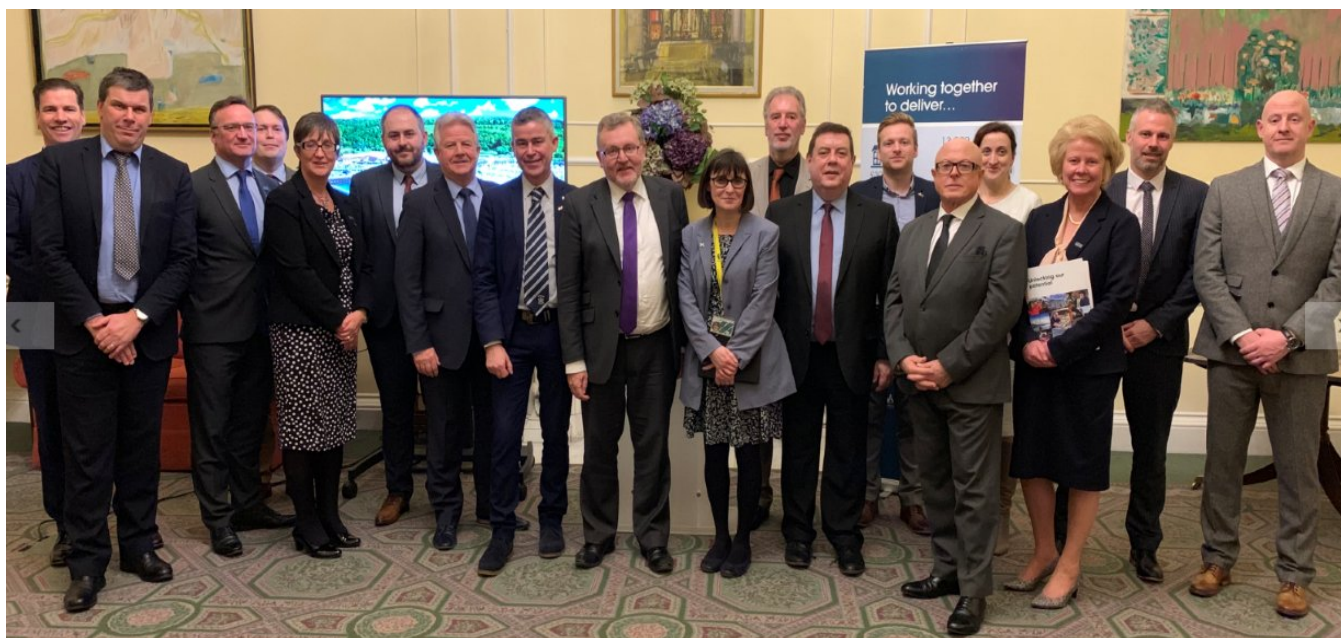
Ayrshire Council Leaders, Chief Executives, business partners and politicians at the Ayrshire Growth Deal reception held in Dover House, Whitehall on 15 January.