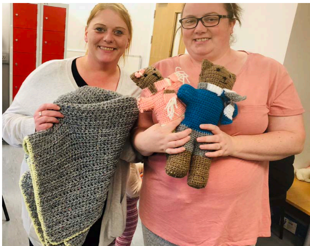
Mums at St Bridget's PS making blankets for the homeless and trauma teddies