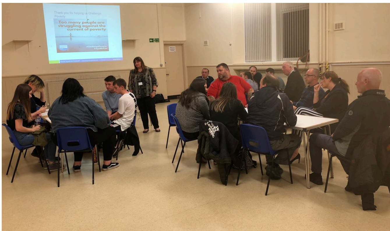
Challenge Poverty Meeting at Bridgend Community Centre in Kilbirnie. Lots of lively discussion

Evening – Meeting in Bridgend Community Centre with community groups, young people, Elected Members and third sector to discuss ideas to tackle poverty. (Zero hour contracts, Garnock transport issues/costs, discounted travel for young people, more education on life skills to be given in schools).