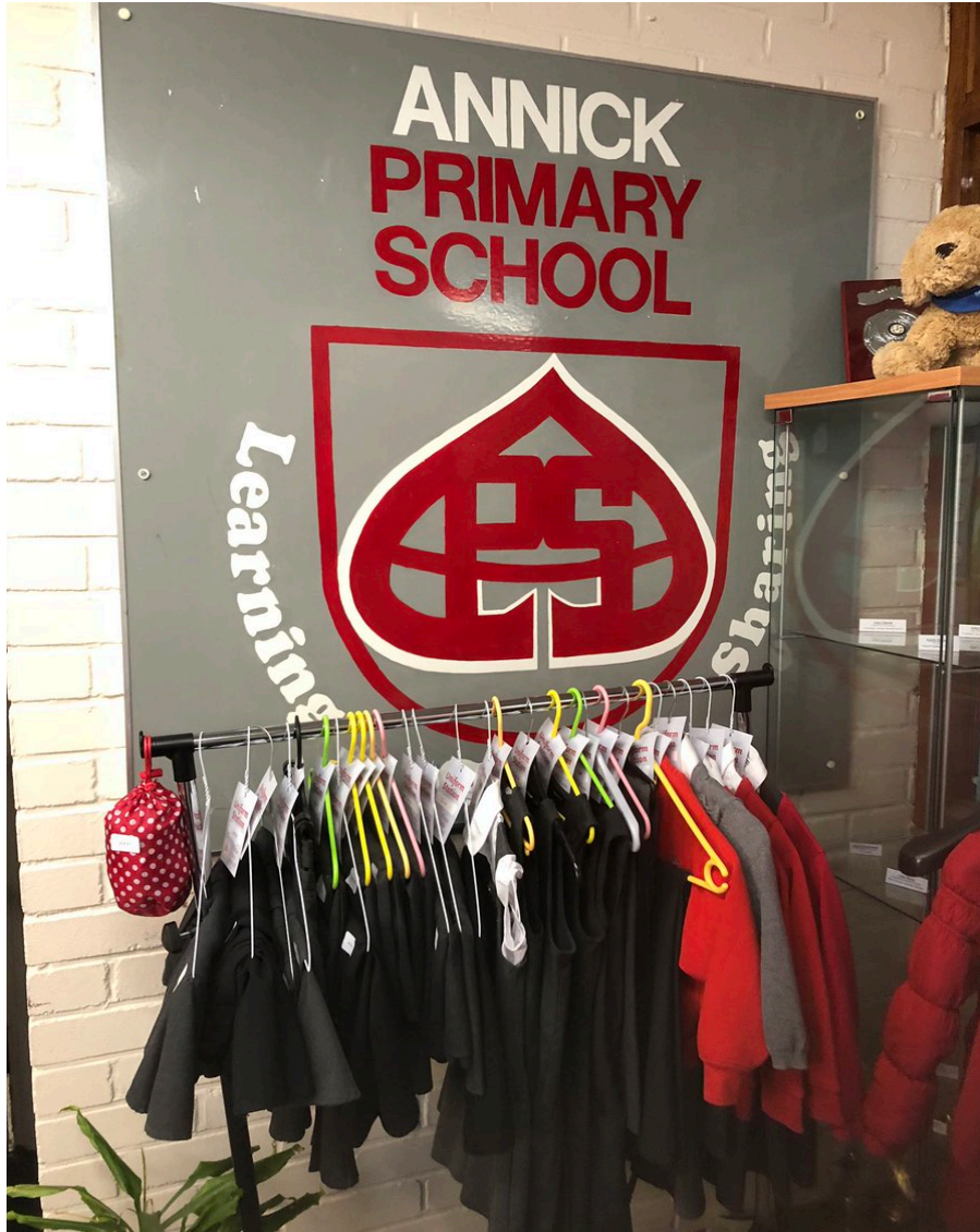
Annick Primary School Uniform Stations – fabulous!