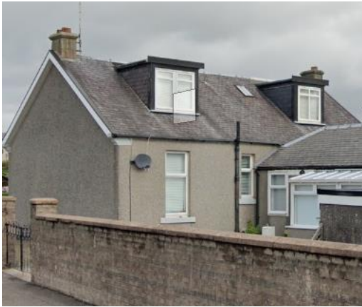
18 Stoneyholm Road, Kilbirnie