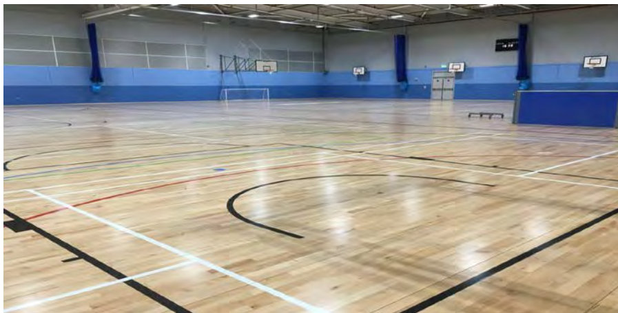
(LARGS CAMPUS GAMES HALL)

This is an example layout only. The Election Team will work with the School to agree a finalised layout/access arrangements that keep electors separate from the School.